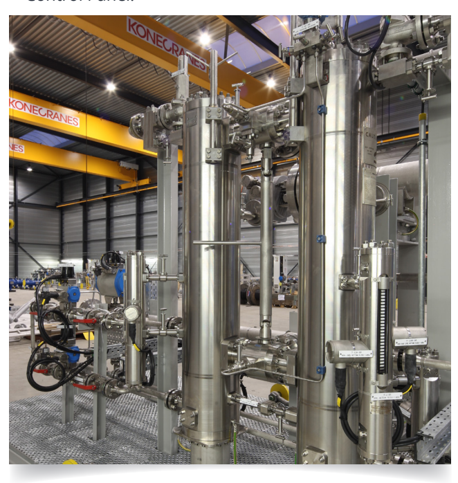
Stainless Steel Package

Please contact our offices for any further information or to receive a quotation: